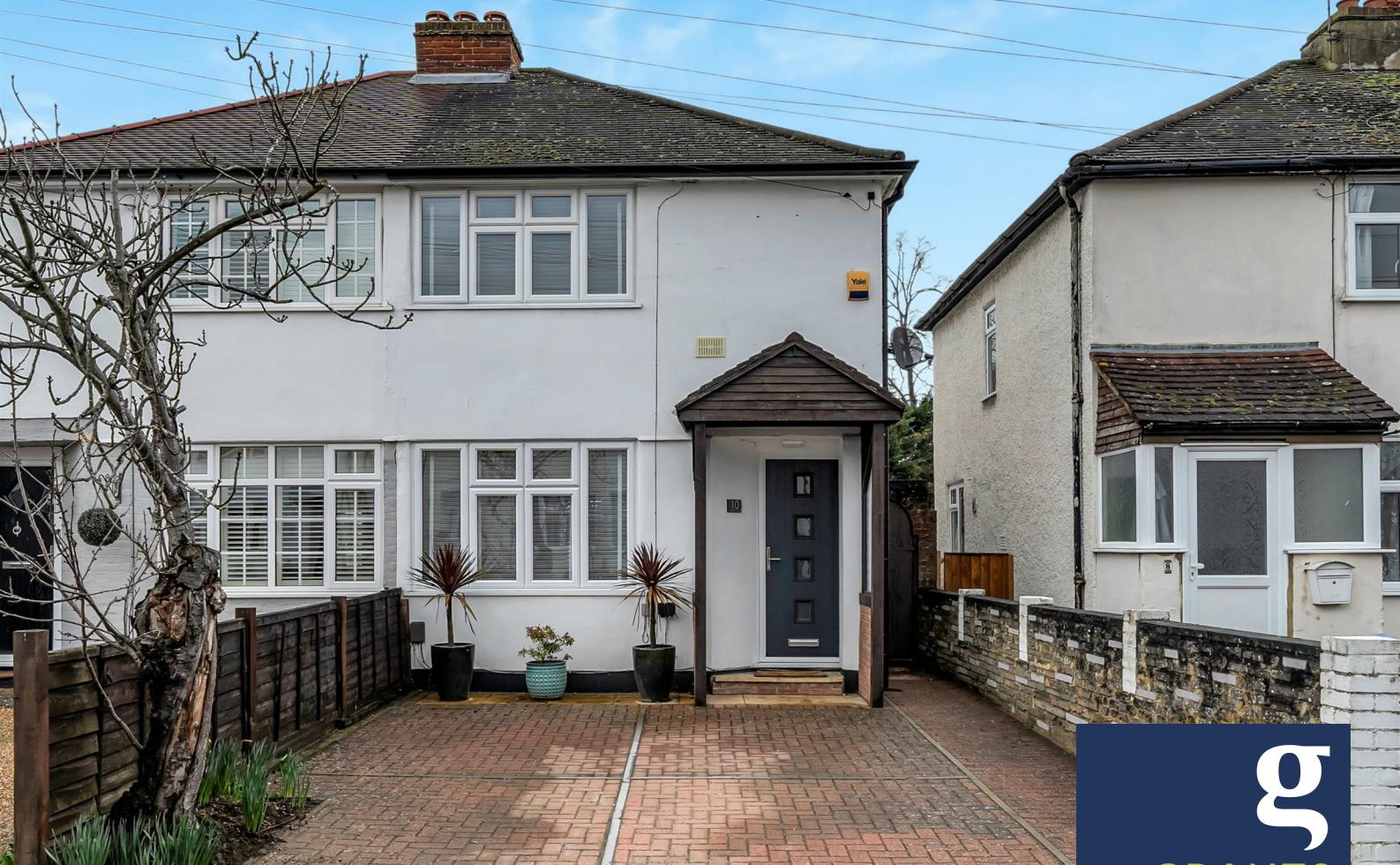
Weston Avenue, Addlestone, KT15 1UW